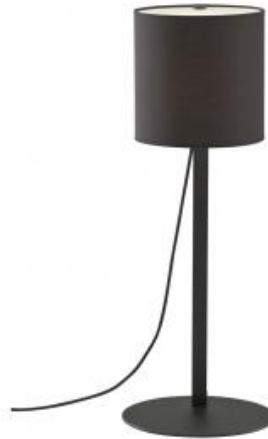
TABLE LAMP BLACK