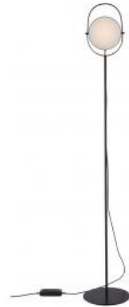
WALL LIGHT RED

Table lamp : Strapping in Epoxy satin black or red lacquered metal. Light (Ø 19.5 cm) in Epoxy satin black or red lacquer with PMMA diffuser. Black textile cable and black manual dimmer switch. Equipped with a 20W LED module emitting 1,800 Lumens or the equivalent of a 130W incandescent bulb. Colour temperature 3,000 K (warm white).