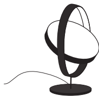
table lamp black