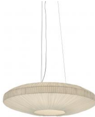
SUSPENDED CEILING LIGHT